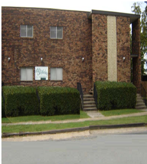
Steeplechase Apartments 6225 Father Tribou Little Rock, AR 72205