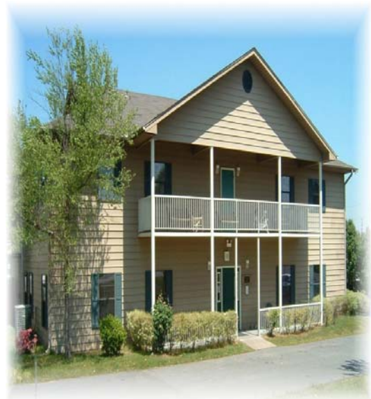
Riverbend Campus 1201 River Road North Little Rock, AR 72114

Accredited by The Commission on Accreditation of Rehabilitation Facilities ( CARF )