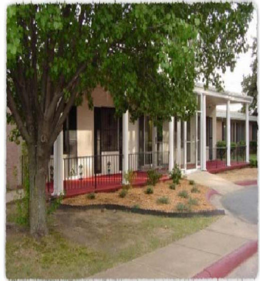
Williamsburg Facility 6301 Father Tribou Little Rock, AR 72205