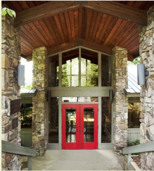
Oasis Renewal Center 14913 Cooper Orbit Road Little Rock, AR 72223